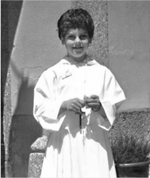
Actual photo of Carlos Acutis on his first Holy Communion

This generation of youth are showing signs of spiritual promise. The first Millennial Saint, Blessed Carlos Acutis is part of the many people who have a devotion to the Eucharist from a young age. His life's work on exploring the Miracles of the Holy Eucharist are all displayed on an active website called: The Eucharistic Miracles of the World . You can view the website he created here: http://www.miracolieucaristici.org/en/Liste/list.html Blessed Carlos willed to receive the Eucharist from the age of 3. He knew from a young age that Our Lord called him to prepare for his First Holy Communion, which he received at the age of 7. In his short but powerful life, Carlos devoted his life to researching about the Eucharist and the presence of Our Lord.