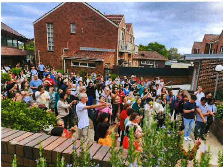
Palm Sunday, 24 March 2024