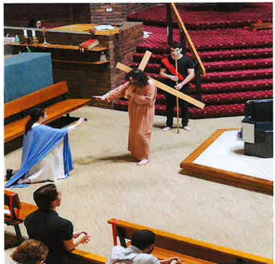
Station of The Cross, Friday, 29 March 2024