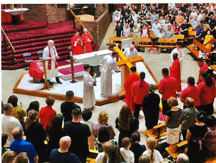
Good Friday, 29 March 2024