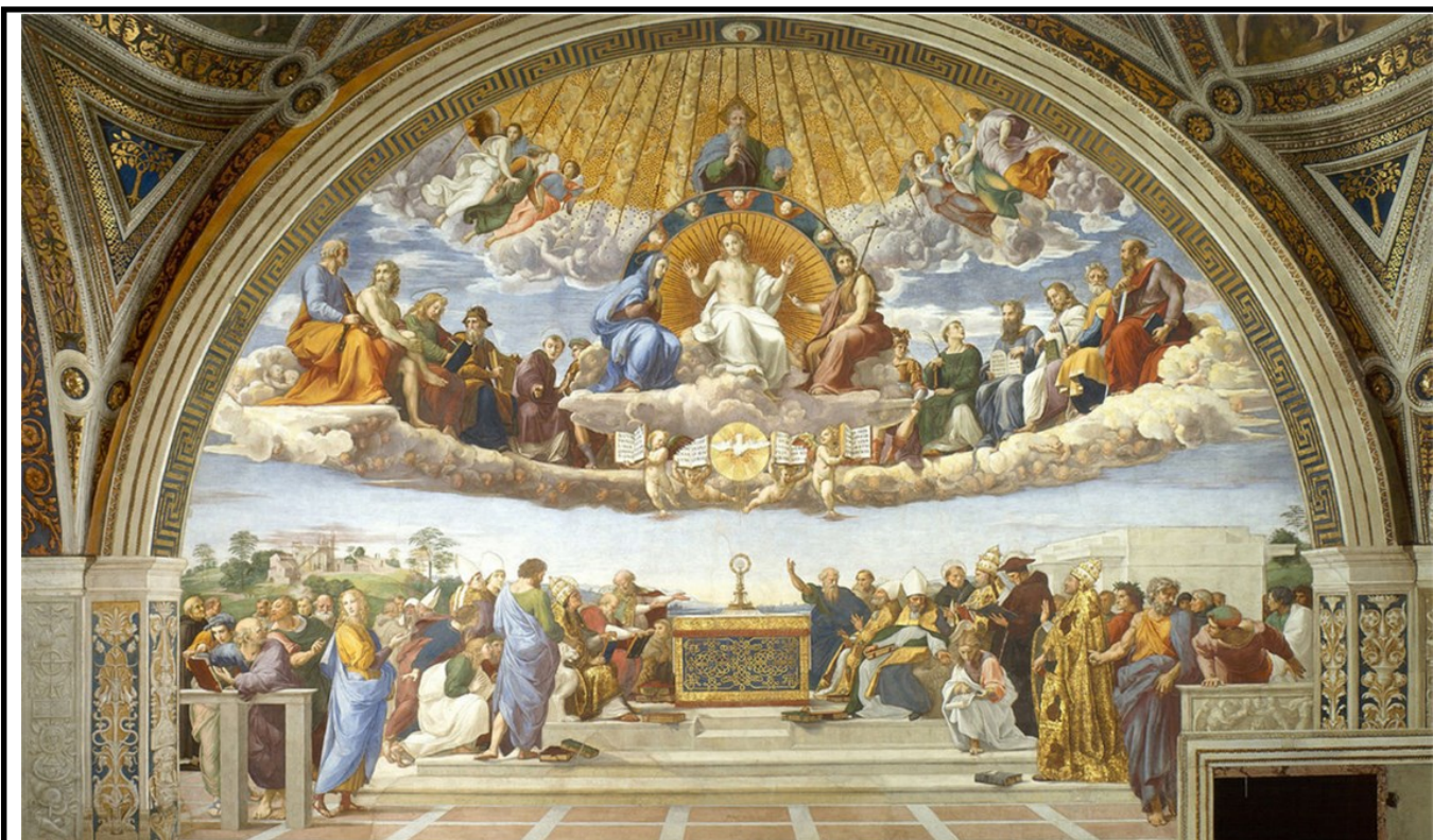
the Disputation of the Sacrament, by Raphael (c.1510) found in Stanze di Raffaello , in the Apostolic Palace in the Vatican.