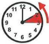
daylight saving time ends

The plots and sub-plots of our lives –complete with suffering, conflicts, struggles, joys and sorrows, success and failure–will find meaning if they are joined with the sacrifice of Jesus for the sake of the beloved. God's Word Daily Reflections 2023