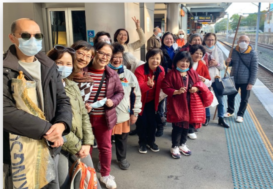
While waiting for the 1:45pm train

The Feast of Corpus Christi was celebrated last Sunday with the Walk with Christ , a public procession of the Blessed Sacrament carried through the streets of the city. Many of our parishioners joined the thousands of people from various parishes, families and friends who all received spiritual blessing. Thank you to all who joined. Our parish was well represented.