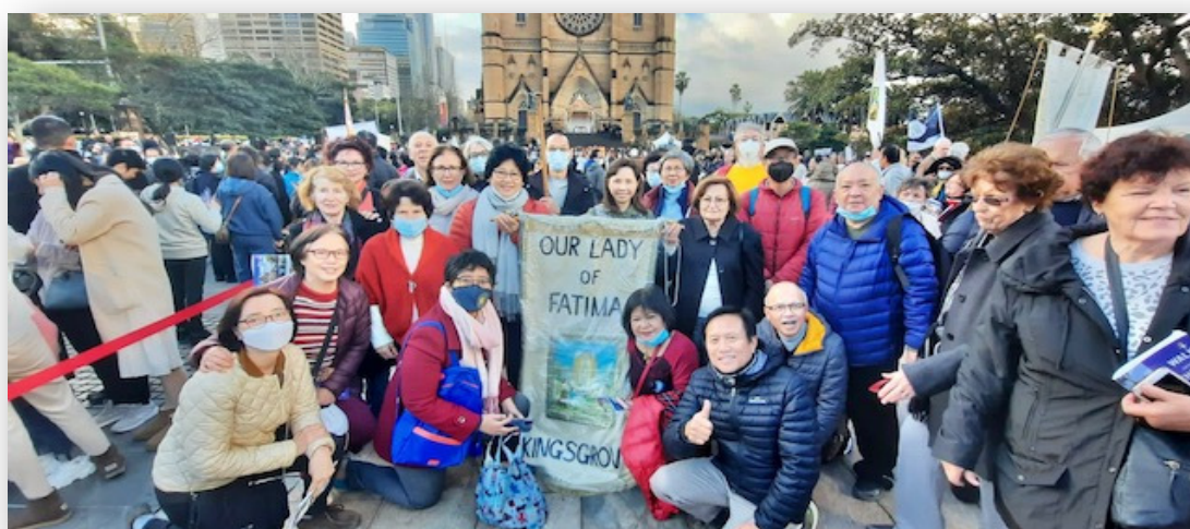
Group photo after the procession, some had already left

Calling all Readers, Acolytes, Ministers of the Eucharist, Children's liturgy Teachers, RCIA and RCIC leaders, Money collectors and those assisting at Parish celebrations.