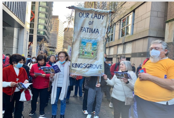
During the procession at Pitt St