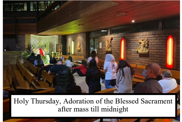
Holy Thursday, Adoration of the Blessed Sacrament after mass till midnight

We give thanks to God for all of you for your generous contributions to the life of OLF Parish Family. In particular, we thank all those who have been generously and skilfully involved in preparing our Holy week and Easter celebrations - those of the Liturgical/ Sacramental Team, Choirs and Musicians, RCIA/RCIC team, Acolytes, Altar servers, Altar Society & Liturgical Decorations, Wardens collectors, door attendants, & Holy Water/Candle Helpers ..... Thank you to all for making our holy journey to Easter a great success!