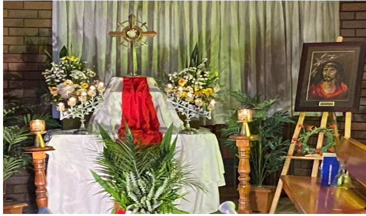
Groups in buses came till midnight for the Adoration at our church